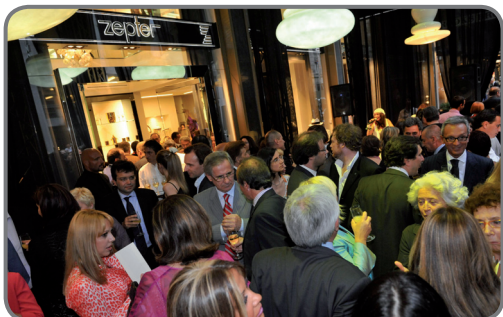
A crowd of important guests and VIPs at the opening of Zepter Lifestyle - Milano