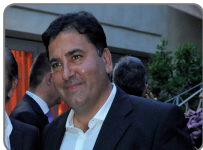
Guido Cappellini, ten-time World Title holder, F1 Powerboat Inshore