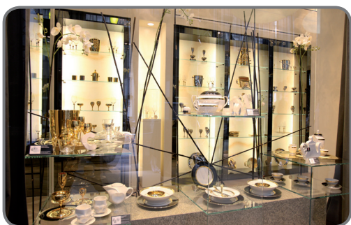
A taste of Zepter, the interior of Zepter Lifestyle - Milano