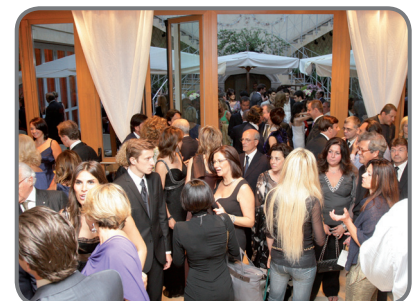
Guests at the exclusive gala dinner at The Four Seasons Hotel